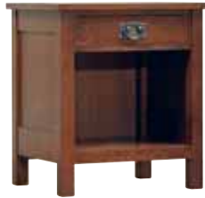
AN-1971 Single Drawer Night Stand 25 h x 22 w x 17 d Not designed for bunching.