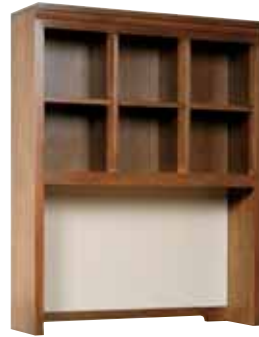
AN-1989 Student Desk Hutch 48 h x 45 w x 13½ d For use with AN-1988. Features task light and cork board. Moulding designed for bunching.