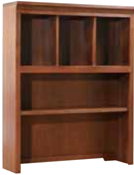
AN-1980 Hutch for Bunching Dresser 48 h x 45 w x 13½ d For use with AN-1979 Dresser. Moulding designed for bunching.