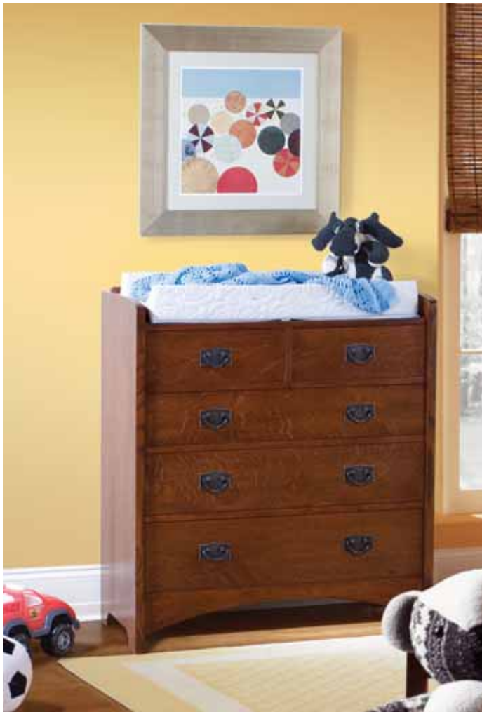
AN-1927 Changing Chest

Stickley® is proud to offer drawers that are hand-fitted and numbered, as well as being side-hung and center-guided. This method guarantees proper alignment of the drawer. The center guide keeps the drawer from skewing sideways. Suspension on the side guides keeps the drawer level, even when heavily loaded. There is never any pressure against the bottom side edges, hence no scrape or screech and no excessive friction, pulling or tugging.