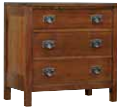
AN-1976 Bunching Bachelor Chest 30 h x 30 w x 19 d Top designed for bunching.