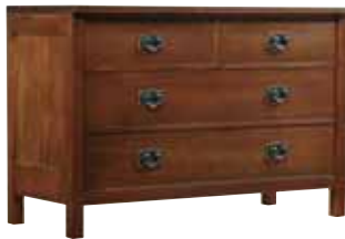
AN-1979 Dresser with Bunching Top 30 h x 45 w x 19 d Top designed for bunching.