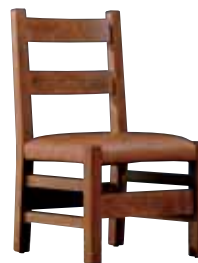
AN-0342 Child's Side Chair 24 h x 14 w x 14½ d Seat height 12"