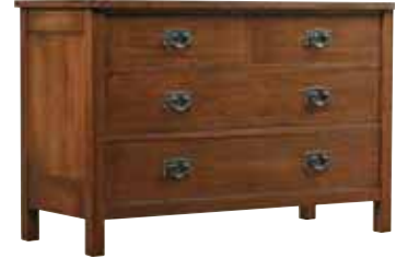
AN-1972 Dresser with Overhang Top 30 h x 46½ w x 19 d Not designed for bunching.

Stickley Starter beds feature adjustable side rail heights. The high position is for use with the trundle bed or storage unit. The low position may be used with a standard box spring and mattress.