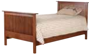
AN-1970 1/2 Twin Spindle Bed 41 h x 46 w x 84 l Footboard: 33½ h