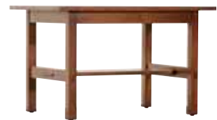
AN-1640 Child's Table 19 h x 30 w x 21 d