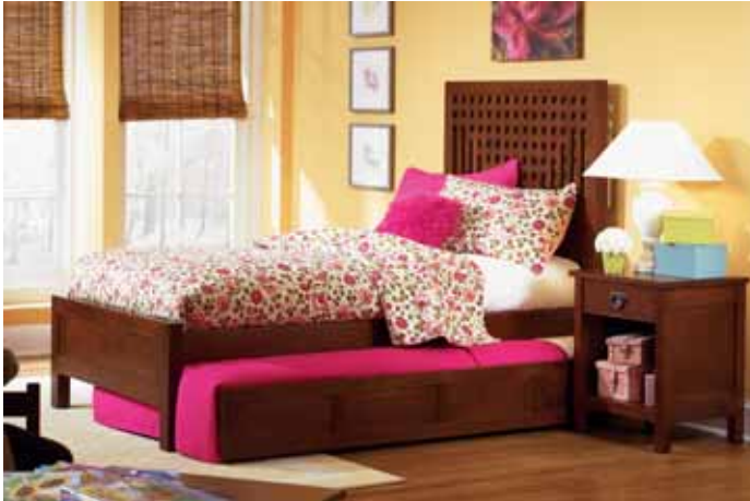
AN-1986 \frac{1}{2} Twin Bed with AN-1984 Trundle AN-1971 Single Drawer Night Stand

Cross rails on cases are dovetailed into the ends to strengthen the case from side to side. On Mission pieces the dovetail is hidden from view. This joint is self locking, even without glue, and separation of the end panels is impossible, unless the wood is split apart.