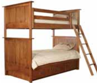
AN-1970 1/2 Twin Spindle Beds as Bunk Bed (Shown with AN-1985 Storage Unit) 74½ h x 46 w x 84 l Front Guard Rail: 18 h x 2½ w x 76 l Bunk bed consists of two twin beds. Top bunk is made from two footboards. Bottom bunk is made from two headboards. Bunk beds may be used as two twin beds when disassembled. When used individually: Headboard: 41 h Footboard: 33½ h