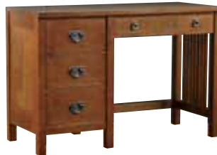
AN-1988 Student Desk 30 h x 45 w x 19 d Three storage drawers and keyboard drawer. Top designed for bunching.