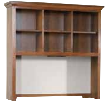
AN-1982 Computer Desk Hutch 48 h x 51½ w x 13½ d For use with AN-1981. Features task light and cork board. Not designed for bunching.