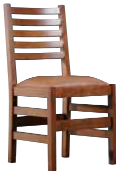
AN-1983 Student Desk Chair 35 h x 18 w x 19 d Seat height 18½"