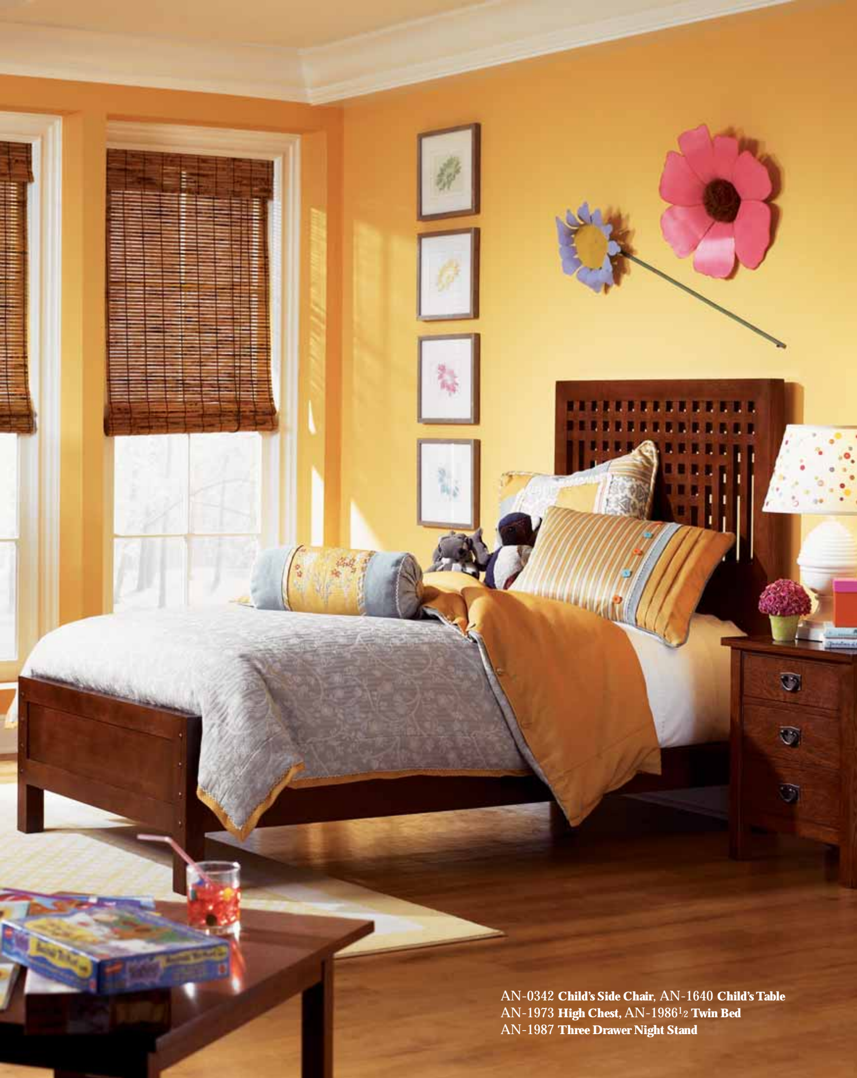
AN-0342 Child's Side Chair, AN-1640 Child's Table AN-1973 High Chest, AN-1986 \frac{1}{2} Twin Bed AN-1987 Three Drawer Night Stand