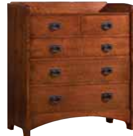
AN-1927 Changing Chest 40½ h x 35½ w x 18½ d Changing pad not included.