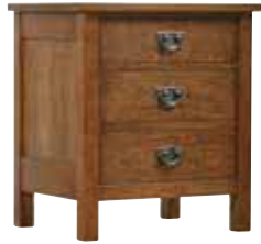
AN-1987 Three Drawer Night Stand 25 h x 22 w x 17 d Not designed for bunching.