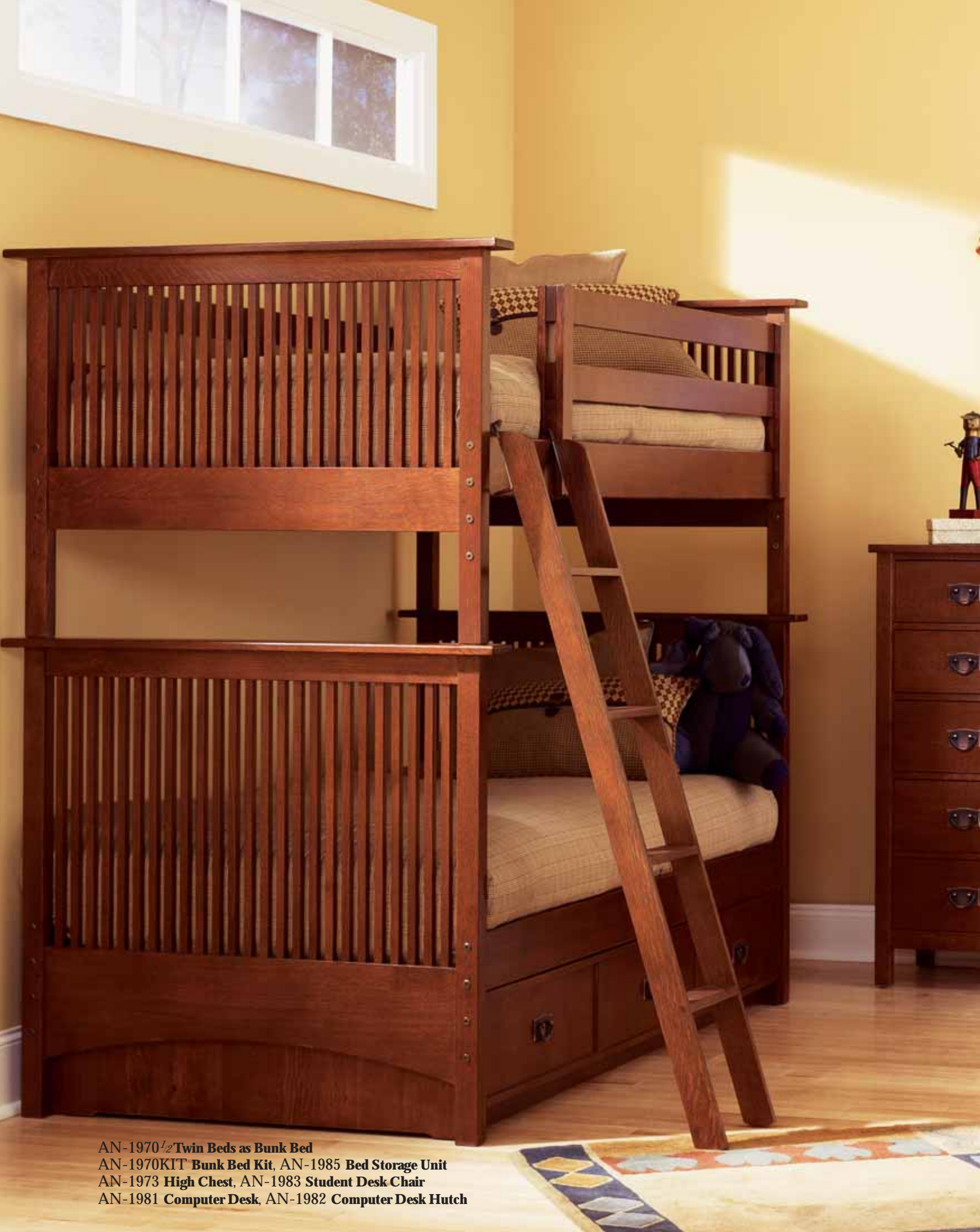
AN-1970 1/2 Twin Beds as Bunk Bed AN-1970KIT Bunk Bed Kit, AN-1985 Bed Storage Unit AN-1973 High Chest, AN-1983 Student Desk Chair AN-1981 Computer Desk, AN-1982 Computer Desk Hutch