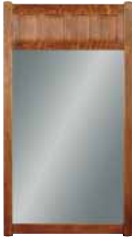
AN-1975 Mirror 45 h x 28 w x 1½ d