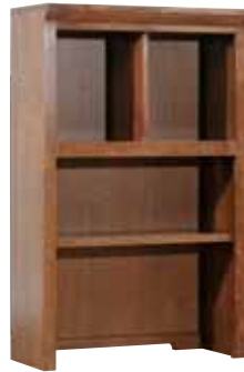
AN-1978 Hutch for Bachelor Chest 48 h x 30 w x 13½ d For use with AN-1976. Moulding designed for bunching.