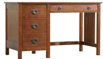
AN-1981 Computer Desk 30 h x 50 w x 24 d Three storage drawers and keyboard drawer. Not designed for bunching.