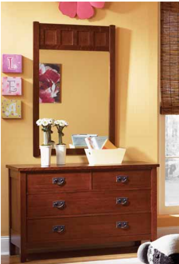
AN-1972 Dresser with Overhang Top, AN-1975 Mirror