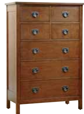
AN-1973 High Chest 48½ h x 38 w x 19 d Seven storage drawers.