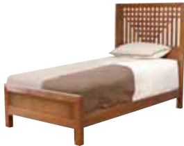
AN-1986 1/2 Twin Willow Bed 55 h x 43½ w x 81 l Footboard: 18½ h Not available as a bunk bed.

Stickley Starter beds feature adjustable side rail heights. The high position is for use with the trundle bed or storage unit. The low position may be used with a standard box spring and mattress.