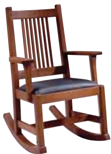
AN-1330R Child's Rocker 26½ h x 14½ w x 21¼ d